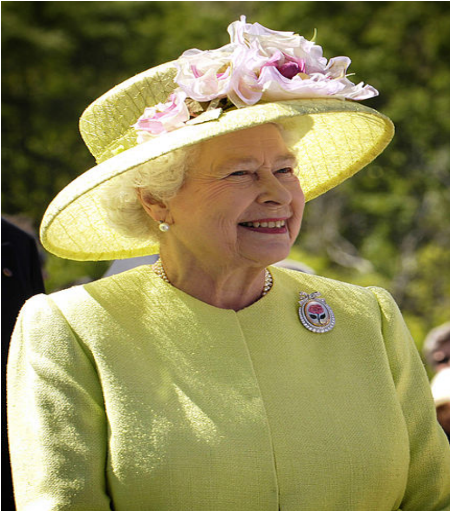
The Queen – the Head of Australia