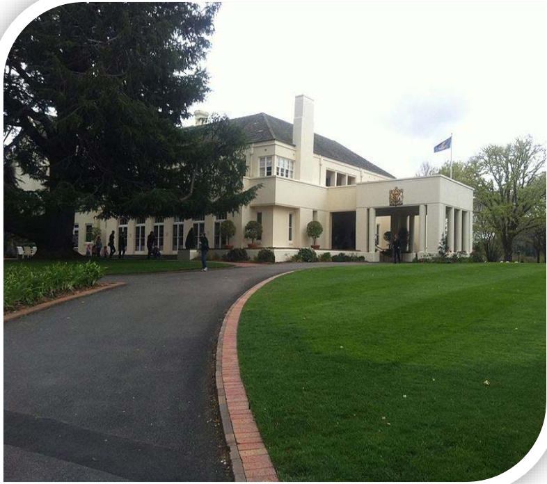
Yarralumla – the seat of the Governor General