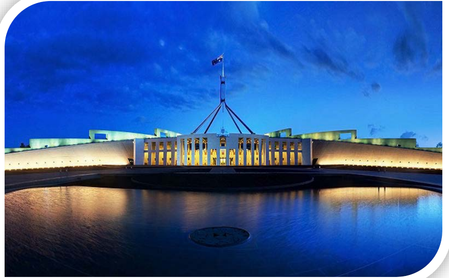
The Parliament House – the seat of the Government