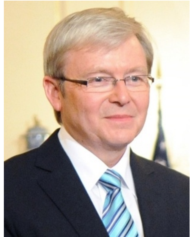
Kevin Rudd - the PM