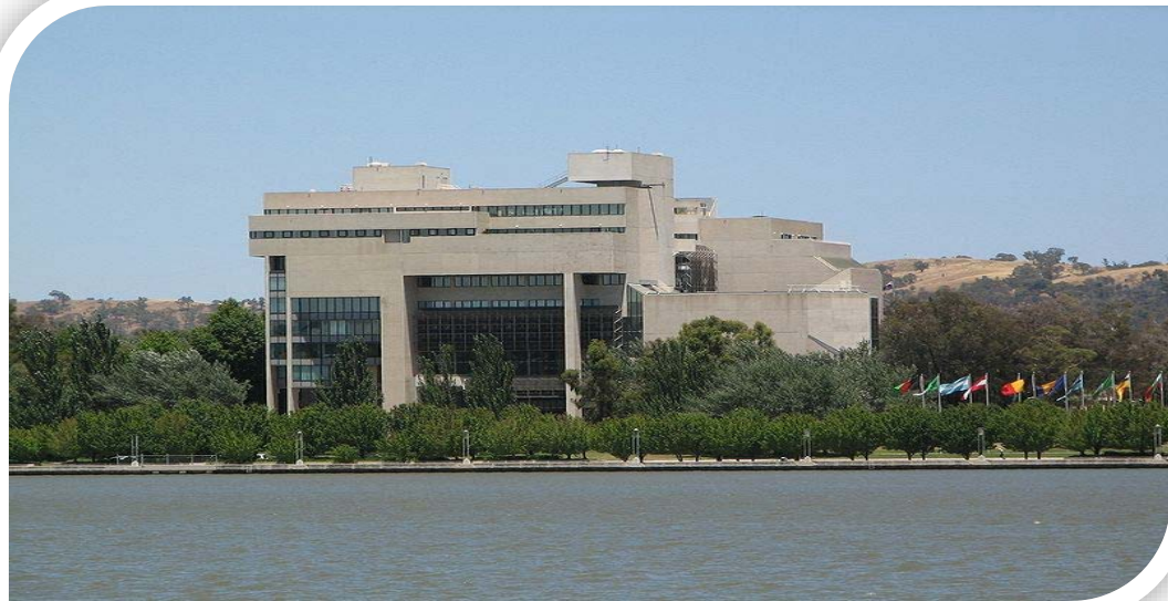
The High Court in Canberra