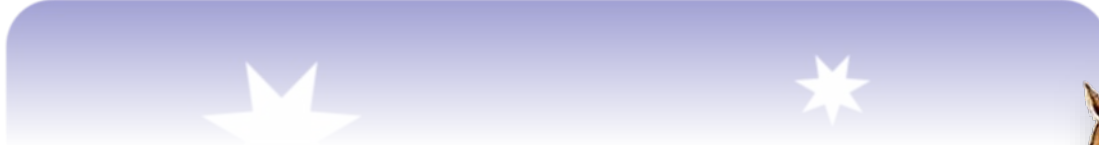
The coat of arms